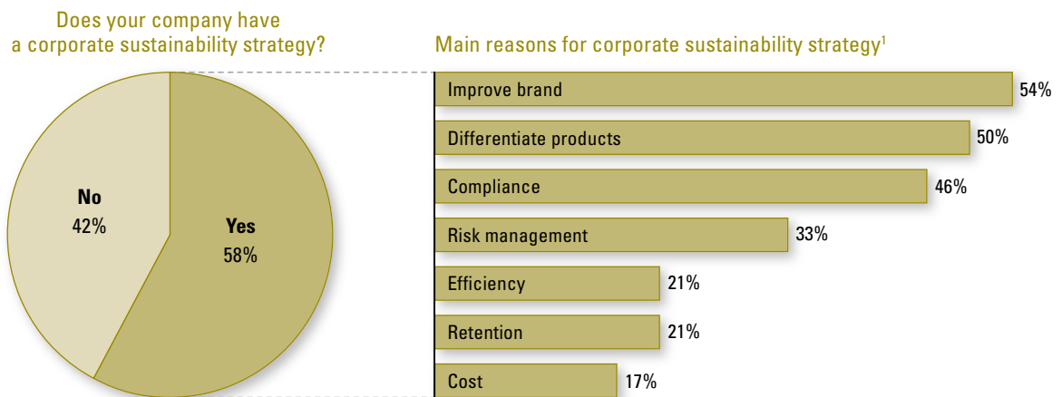
Figure 1 Companies adopt sustainability strategies to achieve multiple goals

Our study reveals that almost 60 percent of firms adopt sustainable practices to strengthen brand names or differentiate their products (see figure 1). More than one-half of the 250 largest U.S. corporations issued reports in 2005 on sustainability or corporate social responsibility. That year, 3M announced that it had exceeded each target in its initial five-year Corporate Environmental Goals (CEG) program and launched a second set of CEG objectives for 2005-2010. CEO Lee Scott committed Wal-Mart to become more environmentally efficient. In recent years, DuPont reduced its energy use by $3 billion. McDonald’s introduced healthier menu items and no longer uses Styrofoam packaging. CVS drugstores offer walk-in clinics providing low-cost basic health care. United Parcel Service is adding alternative-fuel vehicles to